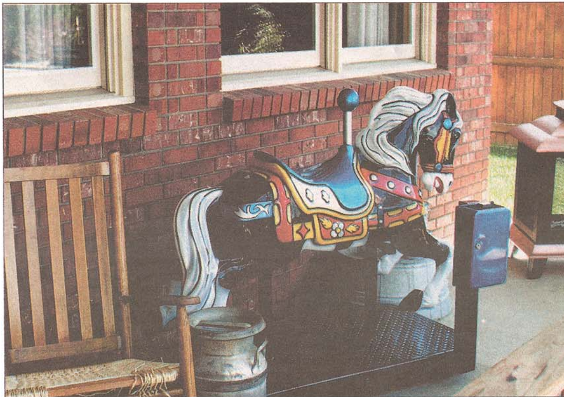
KIDDIE RIDES USA

Enjoy a ride on the mild side: Coin-operated kiddie rides bring whimsy to your private playground.